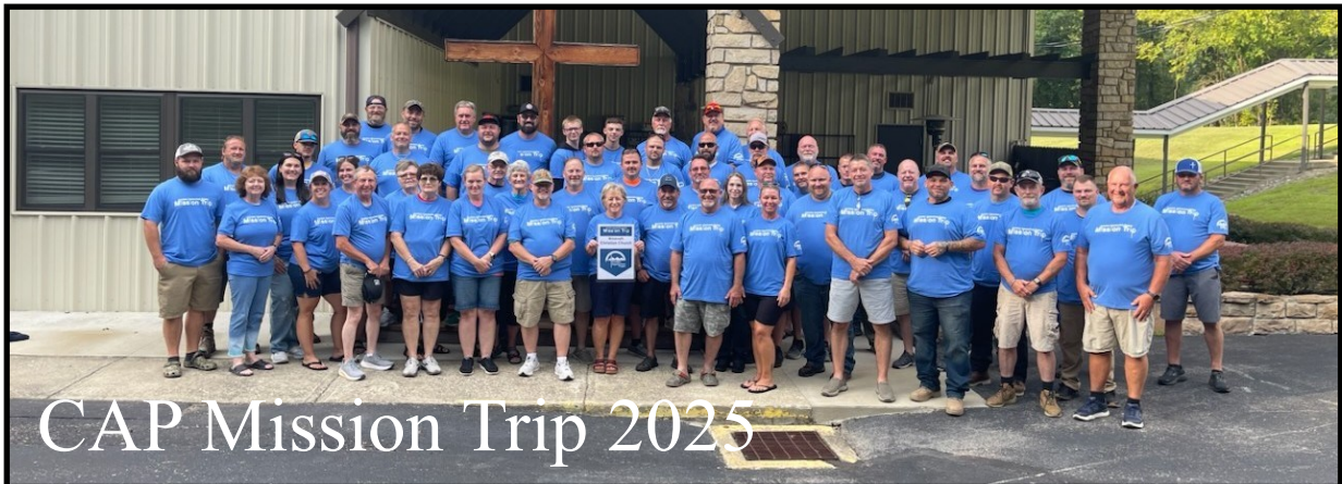
CAP Mission Trip 2025